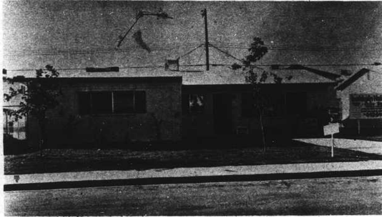
Baldwin Heights Models Located At 1904 Lawry 642-7477

Now you can rent or lease a home of your choice.