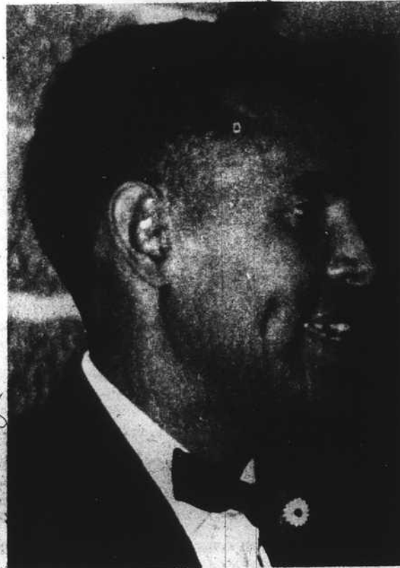
Somali Prime Minister Abdirazak Haji Hussein, whose short-lived government resigned on July 14.

any more than the people of America are all white, or any more than the Afro-Americans are all black.