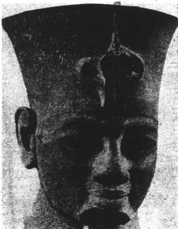
THOTMES III (British Museum)

THIS GREAT EGYPTIAN warrior king was definitely Negroid as is illustrated by his statue which is on exhibit in the British Museum. A photograph of this statue is displayed as convincing evidence of his ancestral stock.