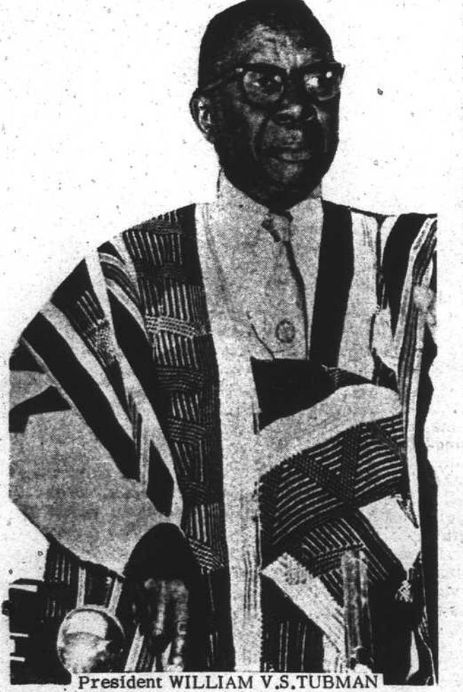
REPUBLIC OF LIBERIA , the first free nation of Africa.

HEAVEN FORBID! We pray that our reasoning is in error.