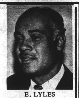
(WARD, from page 2)

gamecocks that if two of these birds were dropped on an island where there was plenty to eat and plenty of room to roam they would eventually encounter one another and fight to the death.