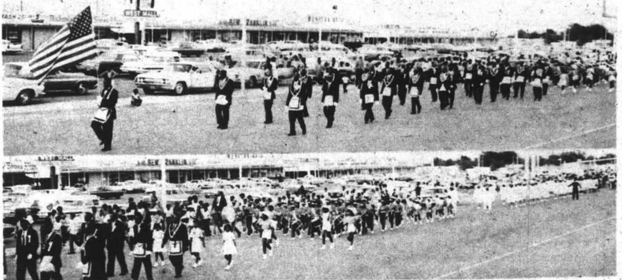
MASONIC PARADE--Above are two views of big parade staged by St. Mark Grand Lodge AF & AM last Saturday as part of Special Session celebration. Top photo shows nobles starting out from in front of Golden West Shopping Center at 'H' St. and Owens Ave. Following them in lower photo are other segments of parade, including Madison School Majorettes, Matt Kelly School drill team, combined bands of Madison, Matt Kelly and Highland Schools and ladies of Order of Eastern Star. (See additional photo on page 3)