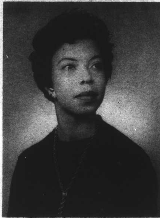
GWENDOLYN LUNDY BENNETT (See 'Who's Who')