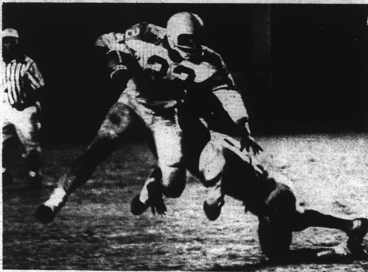
NEGRO STAR "SAVES" SOUTH--Olympic sprint champ Bob Hayes (shown above twisting away from tackler) helped earn a 7-7 tie for his South team in their Senior Bowl football game with a North squad last Sunday in Mobile, Ala., when he scored on a 53-yard pass play from "Golden Boy" Joe Namath. Florida A&M gridder has been signed by Dallas Cowboys of NFL.