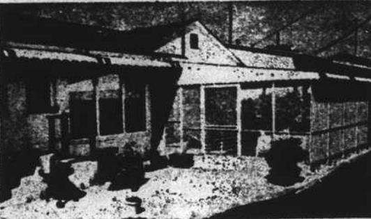
AIR-KOOL'S ALUMINUM PATIOS and AWNINGS are—BUILT-PROOF REINFORCED STEEL UNDERSTRUCTURES

The NEWPORTER Can Easily Be Converted to a Bug-Free Patio Anything You Desire.