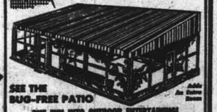
SEE THE BUG-FREE PATIO PUT FUN INTO OUTDOOR ENTERTAINING!