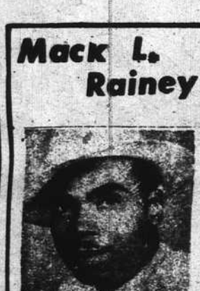
AIR CONDITIONED Barber Shop