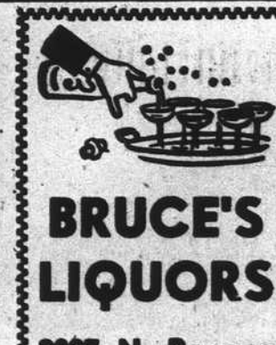
2027 N. Revere 642-4394