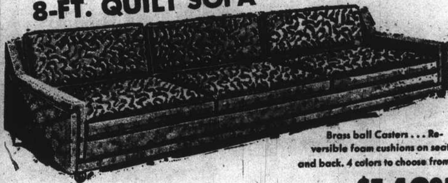
Brass ball Casters... Reversible foam cushions on seat and back. 4 colors to choose from.

Our regular stock price $229.95 Now $149 95