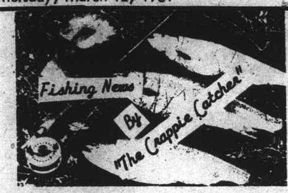
WHAT IS A FISH?

ASK ANYONE what sort of creatures live in water and nine times out of ten the first answer will be "fish." A vast and colorful horde of other living things make their home in the oceans, lakes, rivers and swamps of the earth, but as far as man is concerned, the fish has always been the most important of water dwellers. And for good reason.