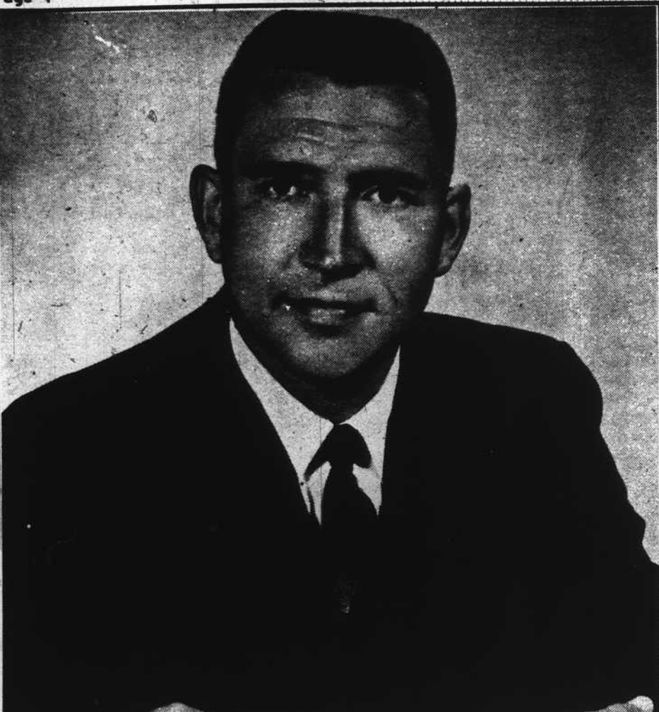
GOVERNOR GRANT SAWYER