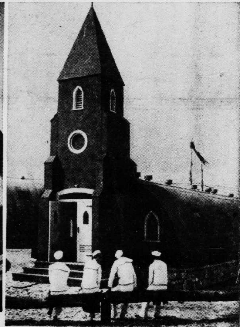
QUONSET 'CATHEDRAL' —Navy officers and enlisted men wait for service to begin in the church on Eniwetok in the Marshalls group. Religious rites were first held in a tent on Eniwetok, but now they have a "quonset period" chapel.