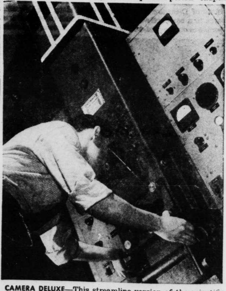
CAMERA DELUXE —This streamline version of the scientific laboratory's precision tool—the cathode ray oscillograph—is now made for war industries. An engineer is shown above as he checks the film pack in the device, which uses a thin stream of electrons to record electrical phenomena.