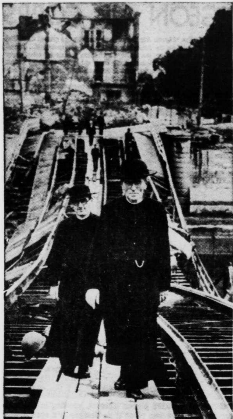
SURVEY WAR DAMAGE —Belgian priests cross a bridge destroyed by German demolition squads before retreating from the city of Namur. A U. S. Army engineer, directly behind the priests, inspects the damage before beginning the repair job. Pontoon bridges were used by the Allies.