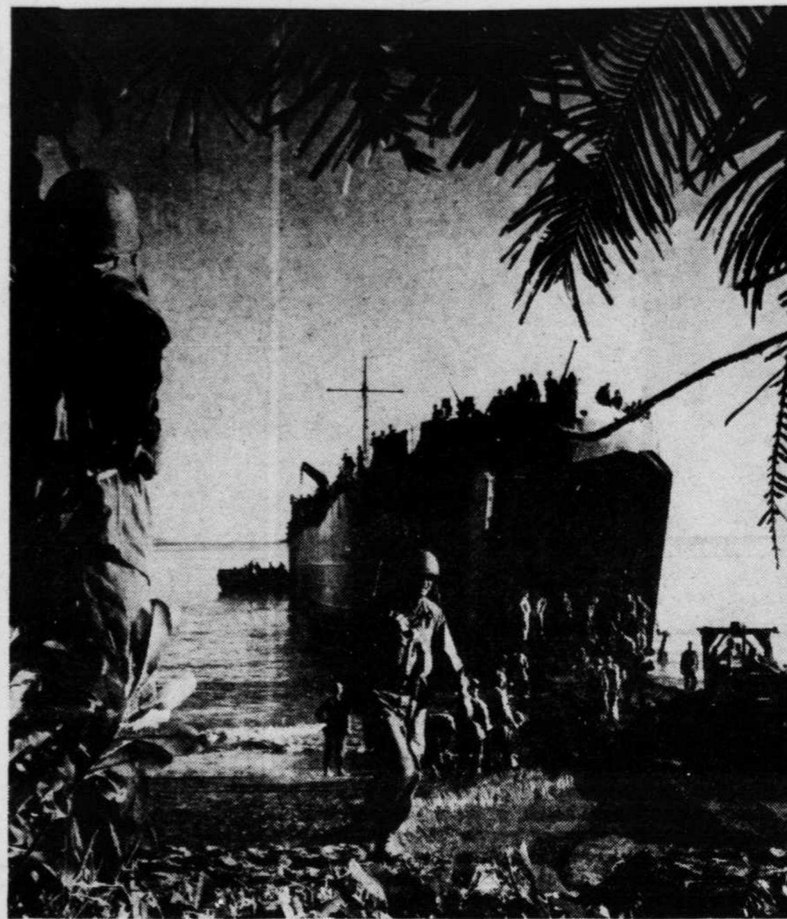
AN LST YIELDS UP ITS WARLIKE CARGO —Occasionally in this war the Allies have encountered martial lagniappe—occupying territory at little or no cost. One of these incidents was the seizure of Sansapor in Dutch New Guinea, where this Navy photo was made.