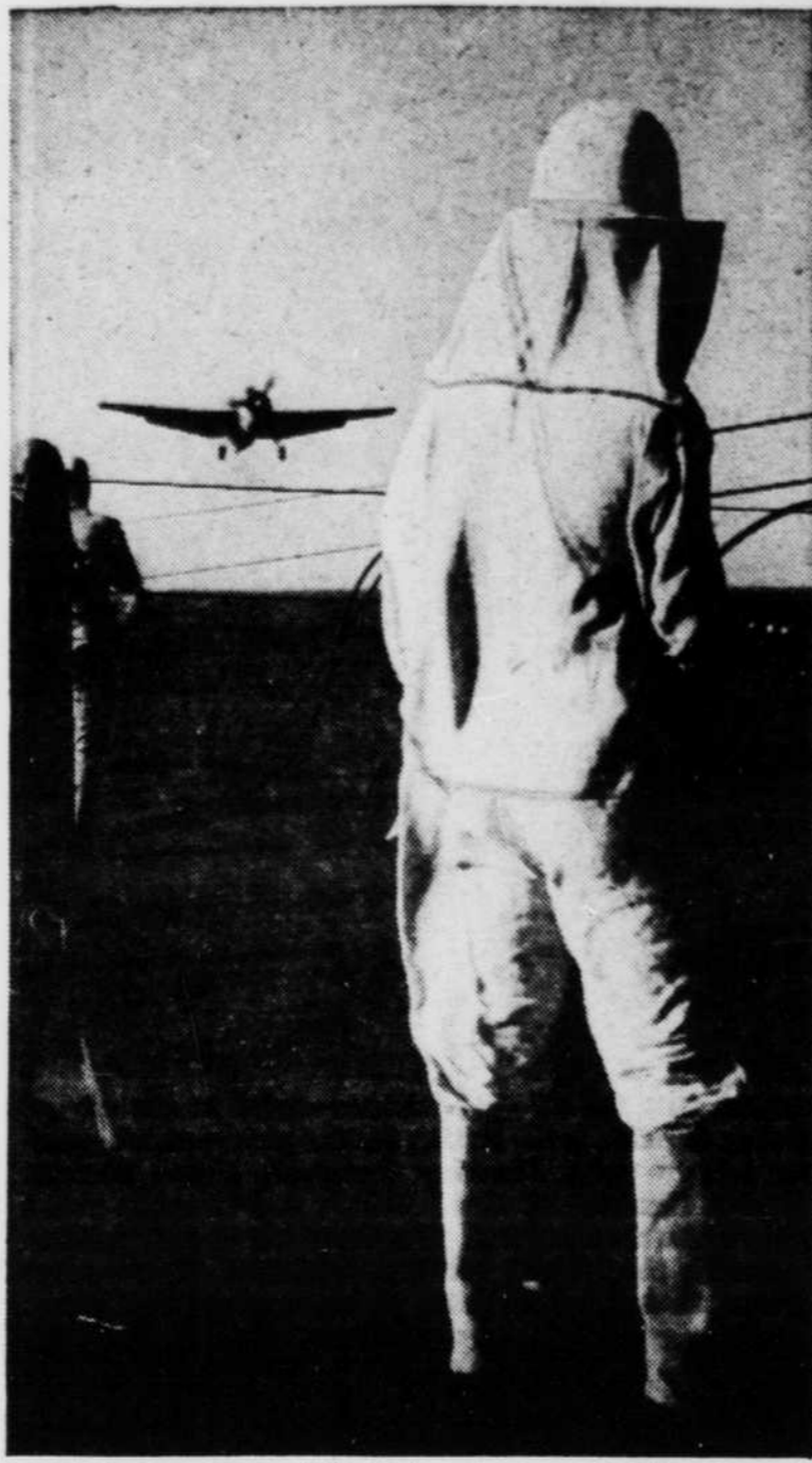
ALWAYS PREPARED —Clad in his asbestos suit, "Hot Papa," as the fire-fighting aircrewman who stand guard during landings are known, is always ready for the worst when planes roar in to carriers. His quick action in case the plane catches fire may save the pilot's life and serious damage to the craft.