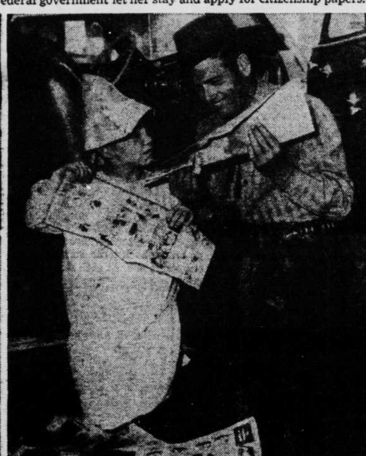
RICHARD ARLEN finds time between scenes of "The Big Bonanza" to educate juvenile actor Bobby Driscoll in the finer .