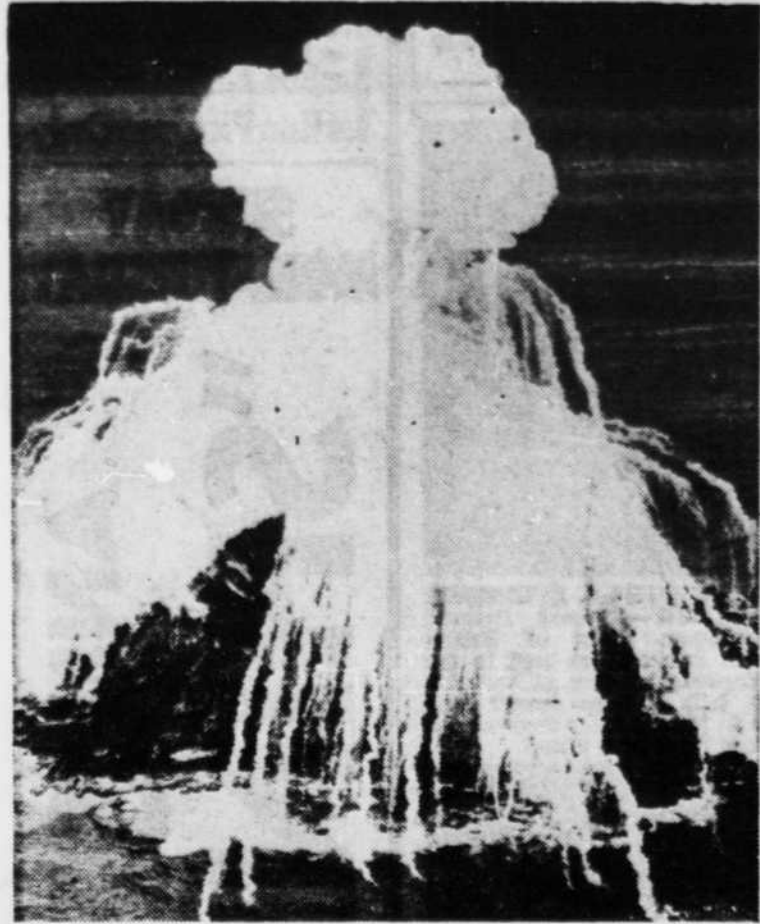
White phosphorus bombs dropped by the Seventh Army Air Force envelop this small Central Pacific island in spectacular deathly embrace.

On the birth side of the ledger this year Clark had 191 and Washoe 142, while a year ago the figures were Clark 158 and Washoe 129.