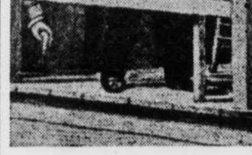
March 4, 1913—Woodrow Wilson takes the oath of office.