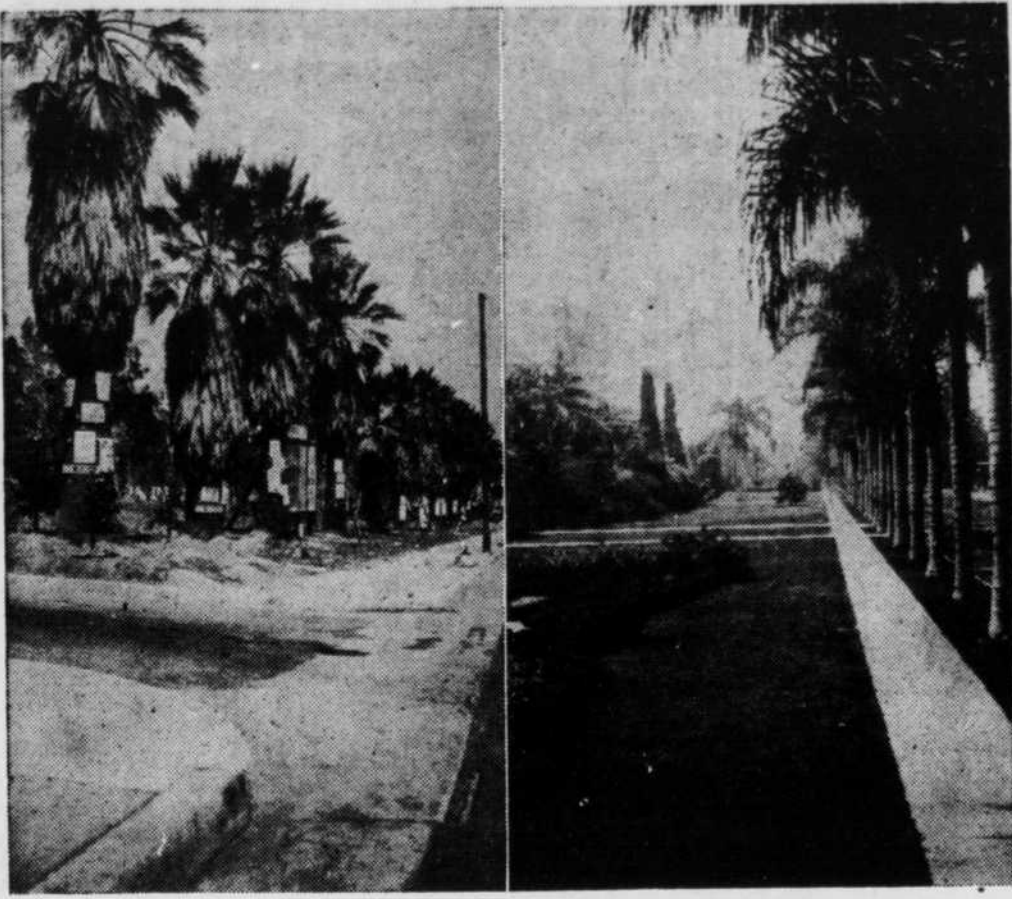
This is not a before and after picture, but it does show two extremes in maintenance and control of subdivisions, according to FHA land planning officials. Although street improvements are present along the unkempt street, the neighborhood certainly lacks appeal because of lack of control. Shrubs grow haphazardly, the trees serve as billboards, and the beauty of the street is marred by the utility poles in the foreground. The other picture shows what can be done to a similar neighborhood by observing sound land-planning principles.