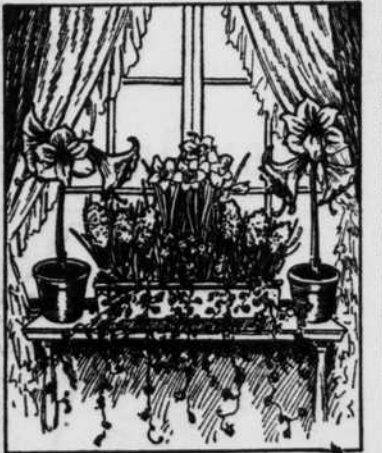
An Indoor Window Garden, With Lilies of the Valley, Daffodils, a Little Ivy and Two Large Amaryllis Plants.

In bulb fibre, which is a mixture of peat and plant food, it is possi-