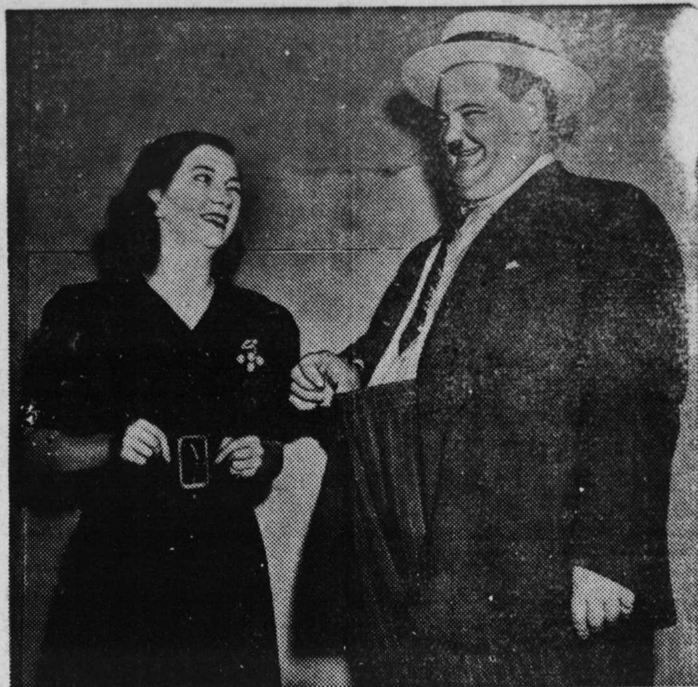
Oliver Hardy and Patsy Kelly? What have they in common? Well, they have both lost the same amount of weight . . . forty pounds to be exact. Patsy will make her svelte debut in Hal Roach's "There Goes My Heart," with Virginia Bruce and Fredric March. And Oliver will make his in a new Hal Roach comedy with his new partner Harry Langdon.