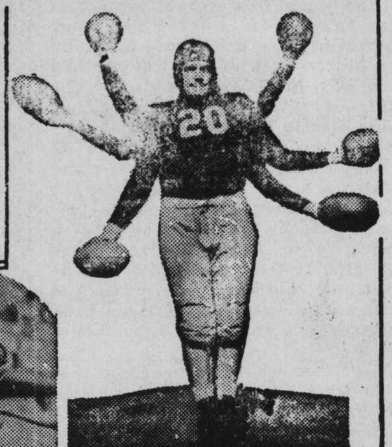
ONE MAN TEAM? No, but this will soon be a familiar sight to Mr. and Mrs. America as Autumn rolls around again. Many a quarterback soon may wish he had as many arms.