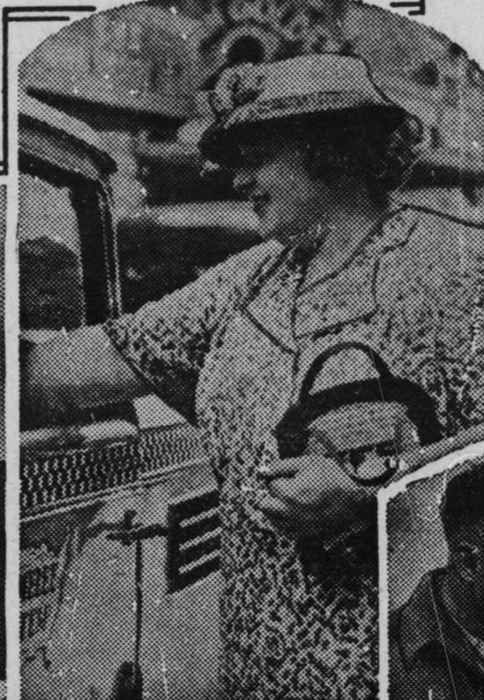
KATE SMITH arrives on the job at the CBS Playhouse off Times Square for first rehearsal of her new Thursday night radio series over the Columbia Network.