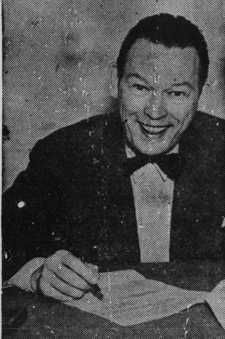
FRED ALLEN signs his name to the dotted line that insures millions of radio listeners another season of mirth and music. The popular comic of "Town Hall Tonight" occupies his usual Wednesday night spot on the NBC-Red Network.