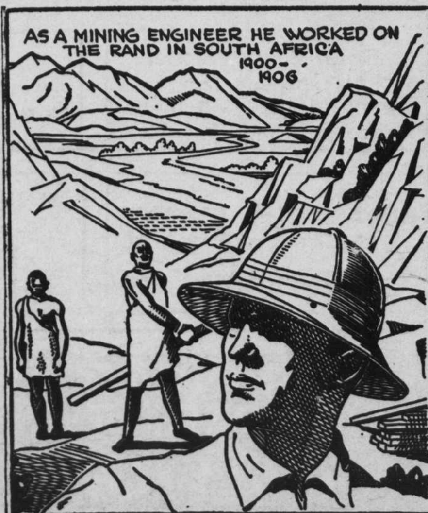
AS A MINING ENGINEER HE WORKED ON THE RAND IN SOUTH AFRICA 1900-1906