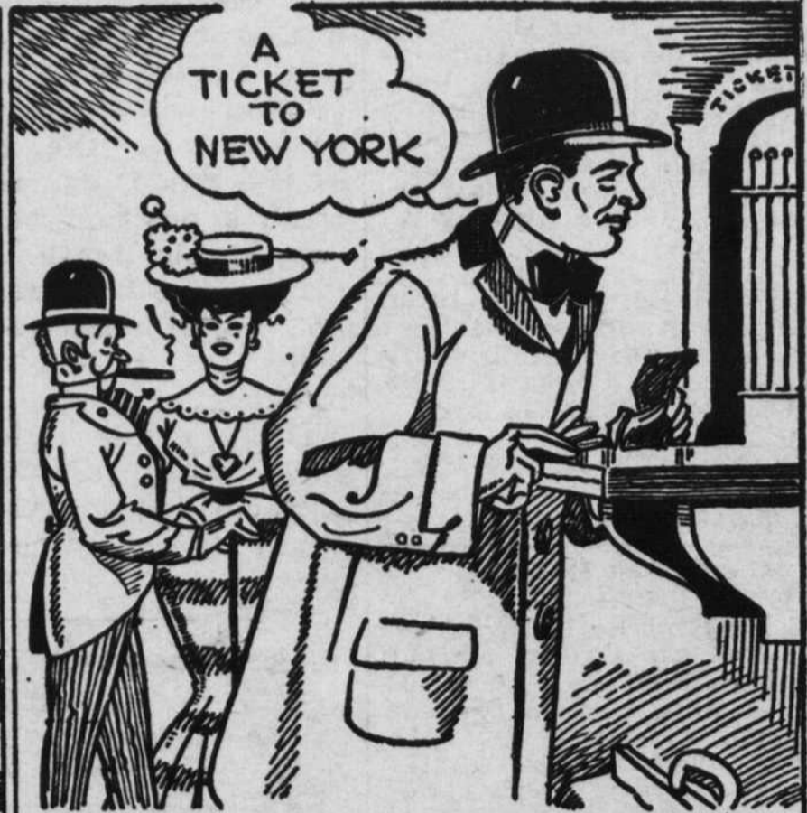
FOLLOWING THIS EMPLOYMENT HE LEFT FOR NEW YORK CITY TO ENTER COLUMBIA UNIVERSITY... WAS THERE AWARDED HIS E.M.