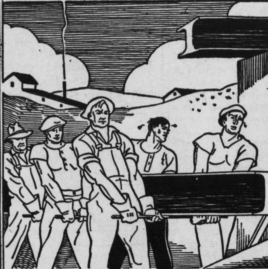
DESIRING TO EARN MONEY TO CONTINUE HIS STUDIES AFTER GRADUATING FROM THE UOFN HE HELPED INSTALL A ROTARY ROASTER AT GOLCONDA