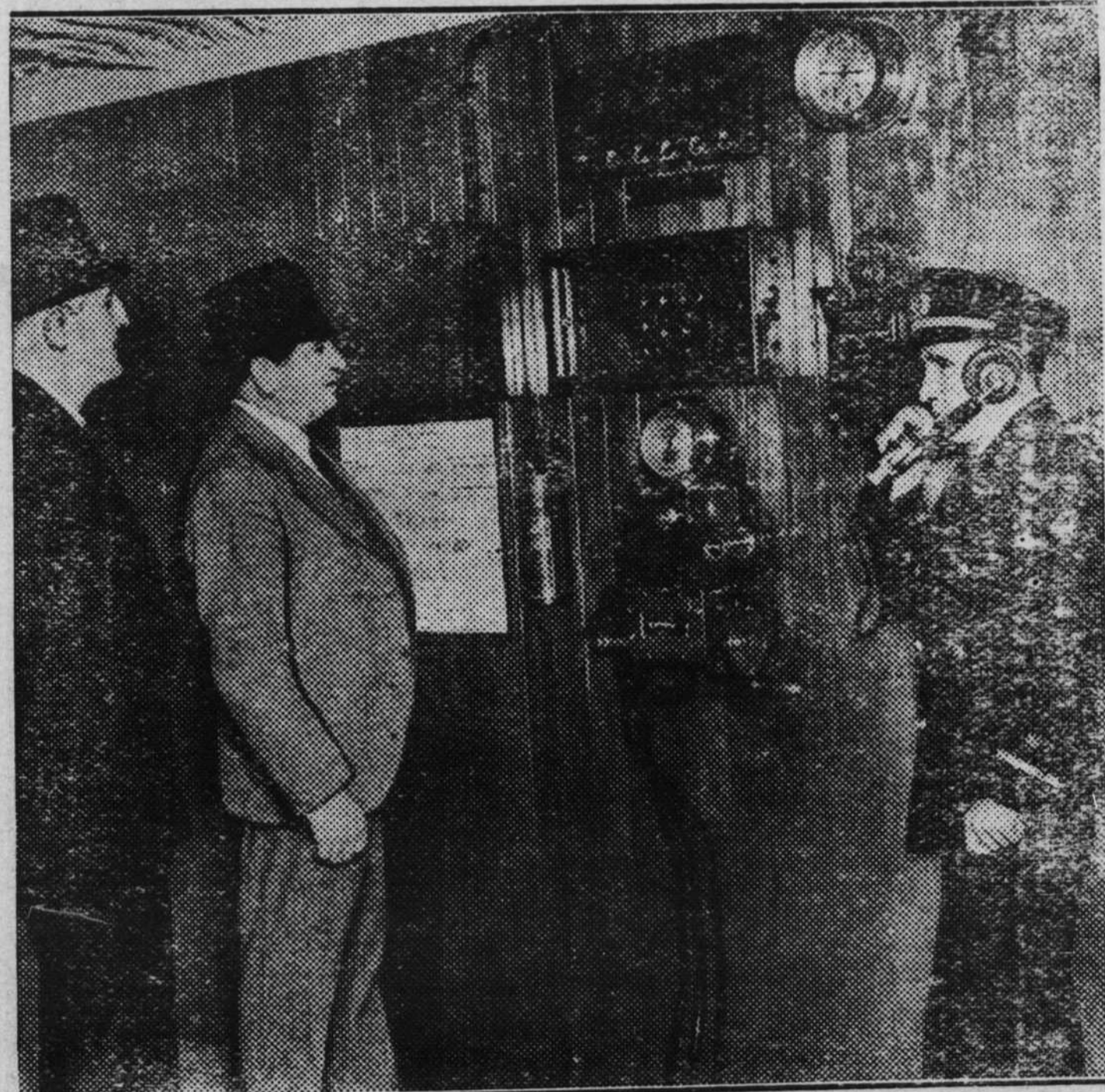
Like any hotel a ship has a complicated telephone system. But it's got to work all the time. Under the eyes of two government inspectors, an officer tests the inter-communication telephone system aboard the Grace Line's "Santa Rosa."