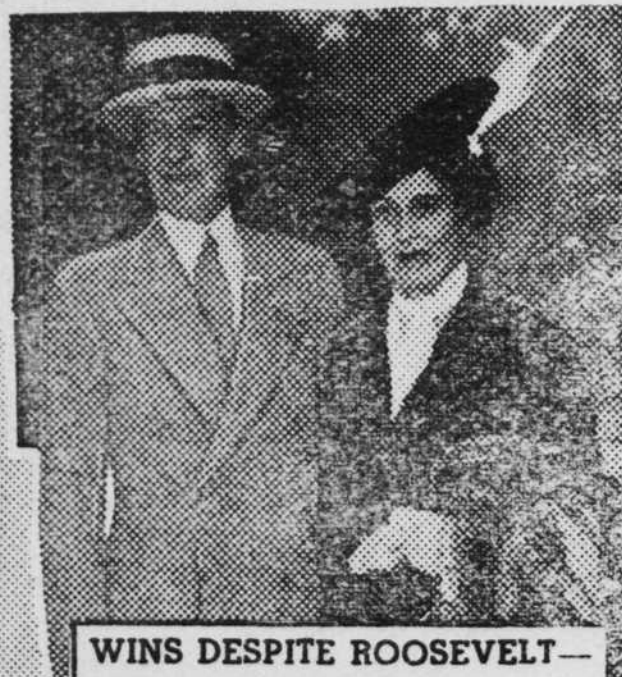
WINS DESPITE ROOSEVELT —Senator Millard Tydings who won renomination to the Senate, is shown with his wife at their Aberdeen, Maryland, home. President Roosevelt campaigned personally against his nomination.