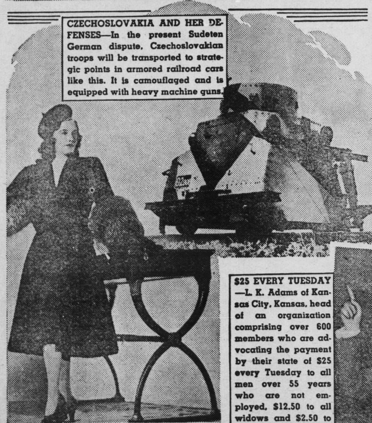
CZECHOSLOVAKIA AND HER DEFENSES —In the present Sudeten German dispute, Czechoslovakian troops will be transported to strategic points in armored railroad cars like this. It is camouflaged and is equipped with heavy machine guns.