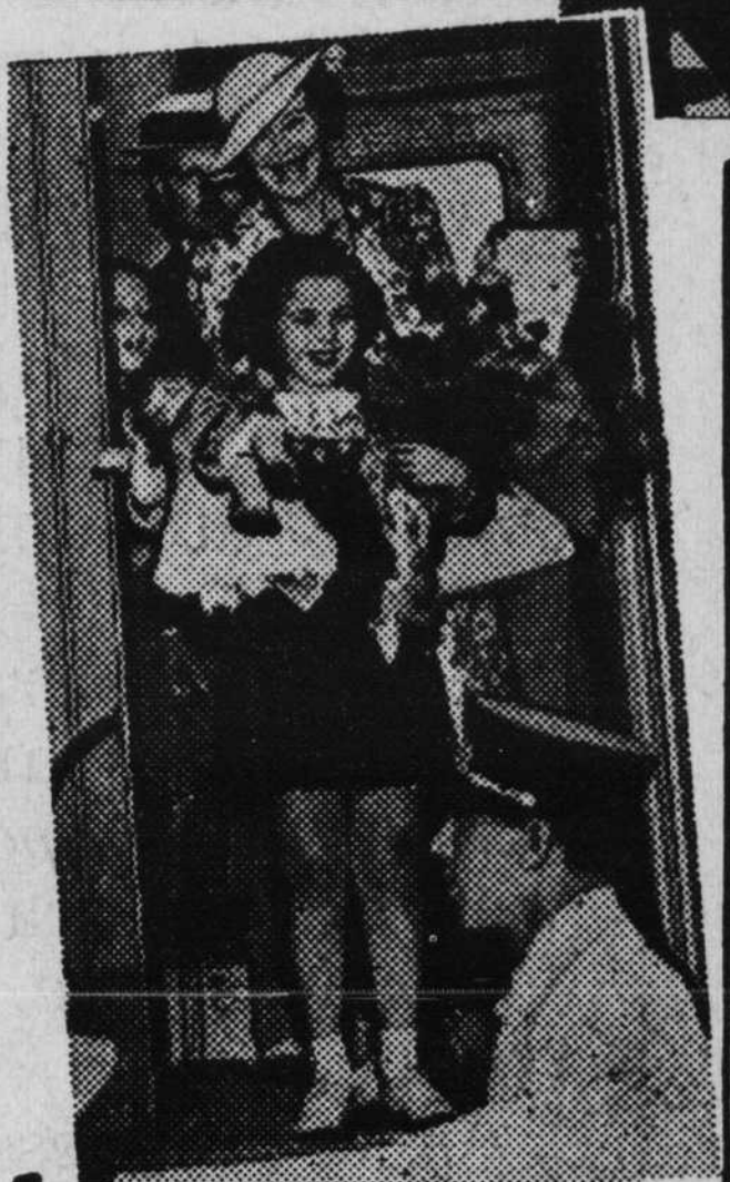
SHIRLEY TEMPLE BACK HOME —Shirley Temple, whose triumphant "vacation" tour of the East was shortened by a slight attack of the Grippe, is pictured with her mother, Mrs. George F. Temple, and her father (background) as they arrived at Pasadena, California.