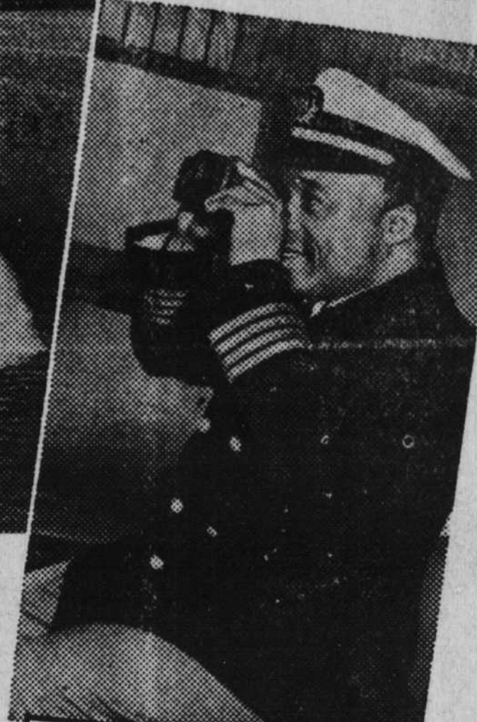
FATHER DIVINE GOES TO NEW "HEAVEN" —Appropriately dressed for the excursion up the Hudson River to the new "Heaven" of his followers at Krum Elbow, across the river from the home of President Roosevelt, Father Divine looks through his binoculars in the Pilot House of "The City of New York."