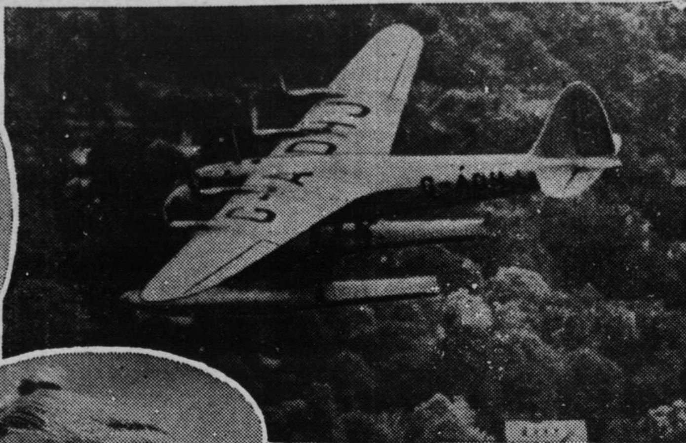
"PICK-A-BACK" PLANE: Air view of the Mercury as it swoops to a graceful and perfect landing after its trans-Atlantic flight of 25 hours.