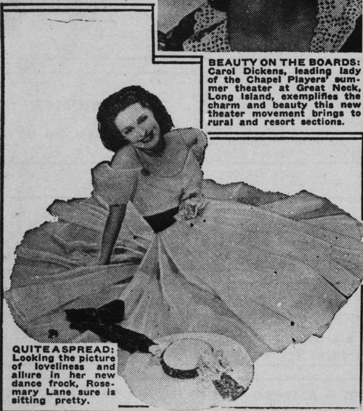
QUITE ASPREAD: Looking the picture of loveliness and allure in her new dance frock, Rosemary Lane sure is sitting pretty.