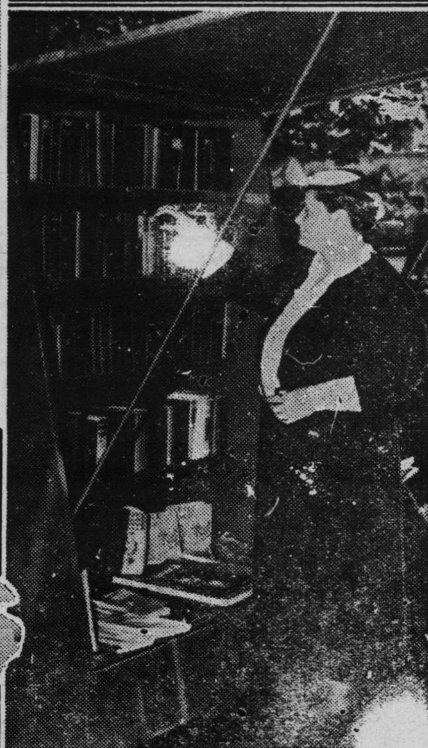
MARY MARGARET McBRIDE, CBS columnist, "discovers" America's only "book bar," a popular summer retreat in New York's shaded Bryant Park. Conducted under the auspices of the New York Public Library, the book bar operates on the "cafeteria" plan, and welcomes casual readers who are free to choose books for park bench reading. Mary Margaret broadcasts Mondays, Wednesdays and Fridays.