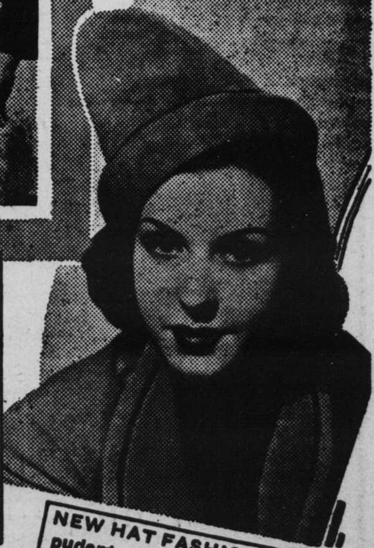
NEW HAT FASHION —Impudent as a wink, perky as spring, this high sweeping hat worn by Ann Miller is fashioned of palest blue antelope with flat peaked crown and rolled brim.

JAPANESE FEED REFUGEES —With refugees steadily coming back to their homes the Japanese Navy had its hands full distributing rice and other foodstuffs to the destitute people.