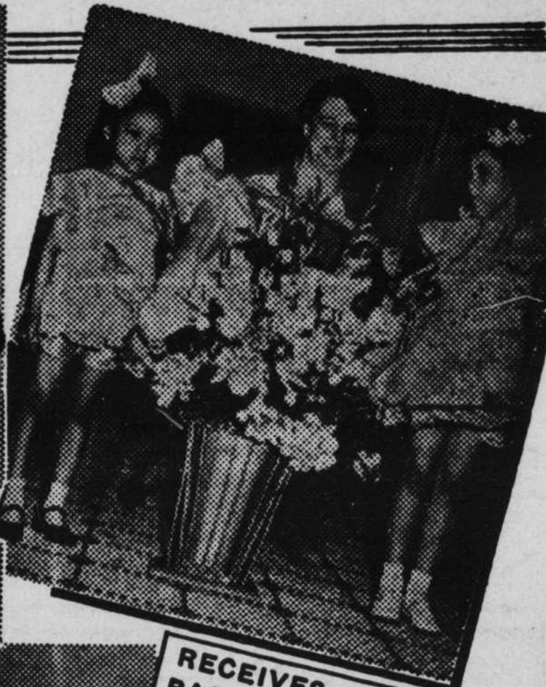
RECEIVES MAY DAY BASKET —Mrs. Franklin D. Roosevelt receives a basket of flowers from two little girls representing the May Day Child Health Committee in observance of National Child Health Day, at the White House.