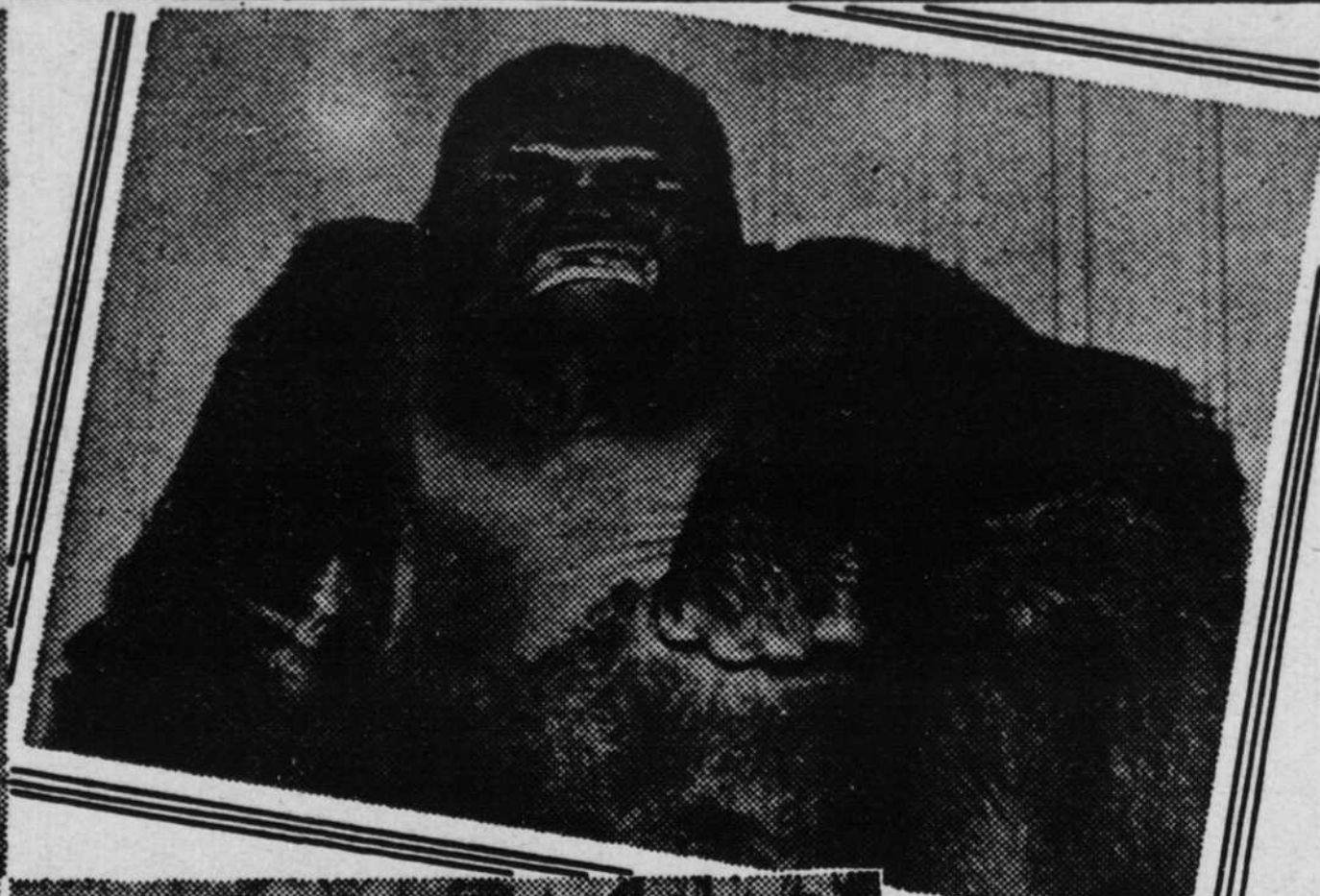
GARGANTUA THE GREAT —Giant gorilla featured this season by Ringling Brothers and Barnum and Bailey Circus.