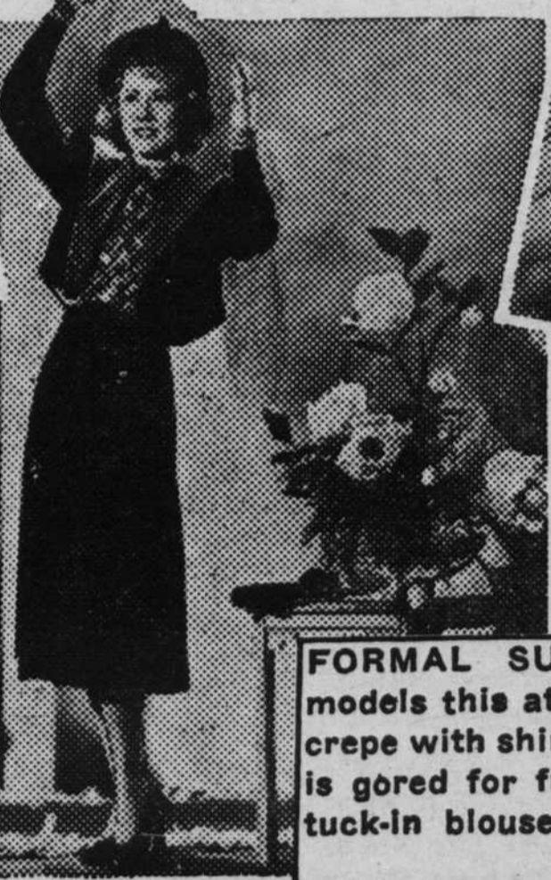
FORMAL SUIT —For formal wear, Irene Dunne models this attractive bolero ensemble of black wool crepe with shimmering sequin blouse. The belted skirt is gored for fullness and the glittering high necked tuck-in blouse is of blue crepe with blue and gold sequins.