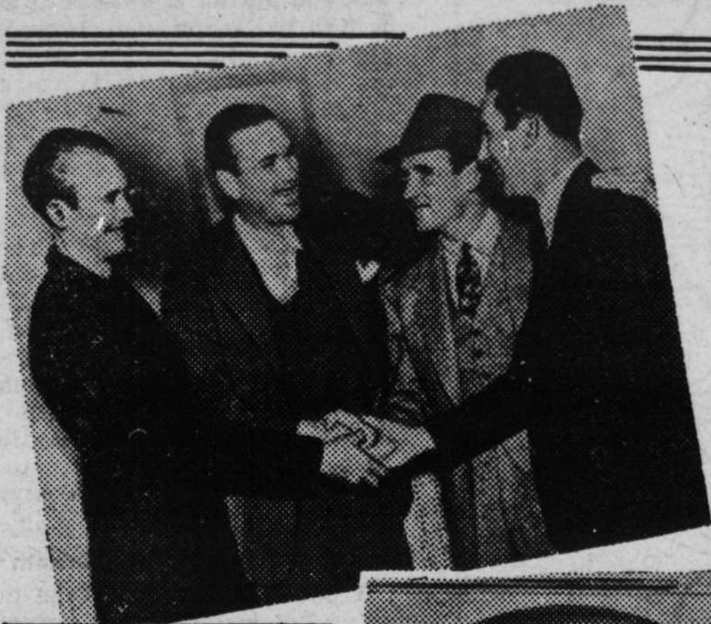
DEAN GOES TO CUBS FOR THREE PLAYERS AND $185,000 —Curt Davis, Dizzy Dean, Tucker Stainback and Clyde Shoun (left to right) as the group met following the announcement of the trade with St. Louis Cardinals.