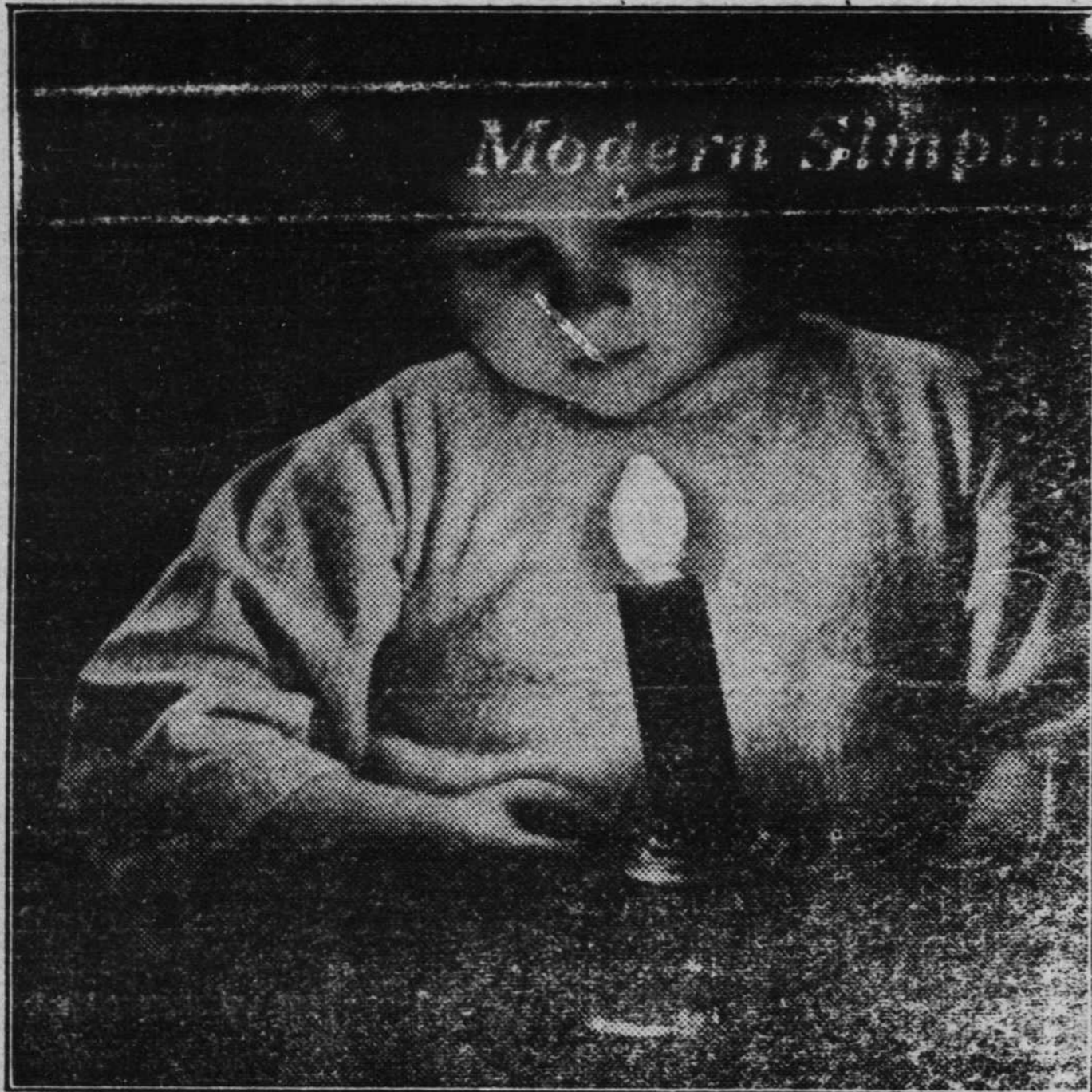
Hard to take? No! A box camera gets it with a 4-second exposure. Other cameras, 1 second at f.6.3. Exposure is short because the light is near her face.

IT IS surprising how little light is needed to make a picture if the light is placed close to the subject.