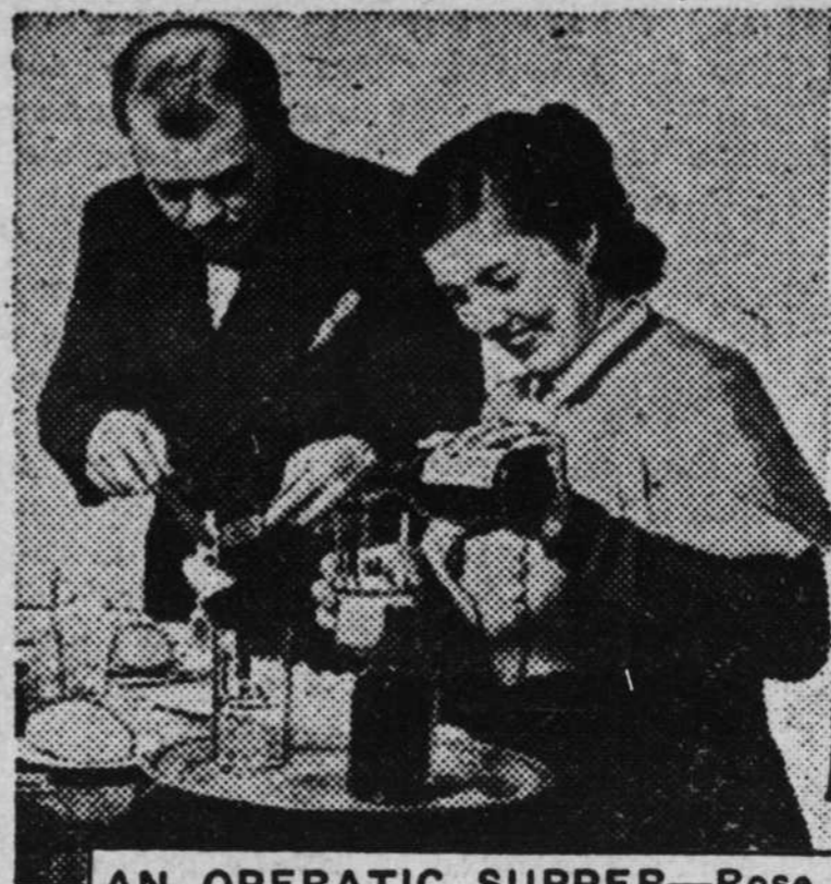
AN OPERATIC SUPPER —Rose Bampton, soprano of The Metropolitan Opera, radio and concert stage, and her husband, Wilfred Pelletier, operatic conductor, enjoy a self-served midnight supper of beer and snacks. Mr. and Mrs. Pelletier are newlyweds, and their apartment, even to the beer glasses, is decorated with the penguin motif, which the two have adopted as their good luck symbol.