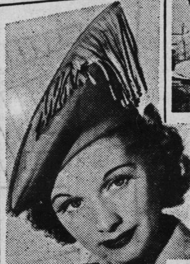
"PRINCE CHARMING" BERET —The gay, dashing beret worn by the Prince Charming in Walt Disney's "Snow White and the Seven Dwarfs" was copied for this smart hat worn by Lucille Ball, featured in "Having Wonderful Time" by RKO Radio. It is made of crimson felt trimmed with a quill of blue-grey felt, a much more clever note than the conventional feather.