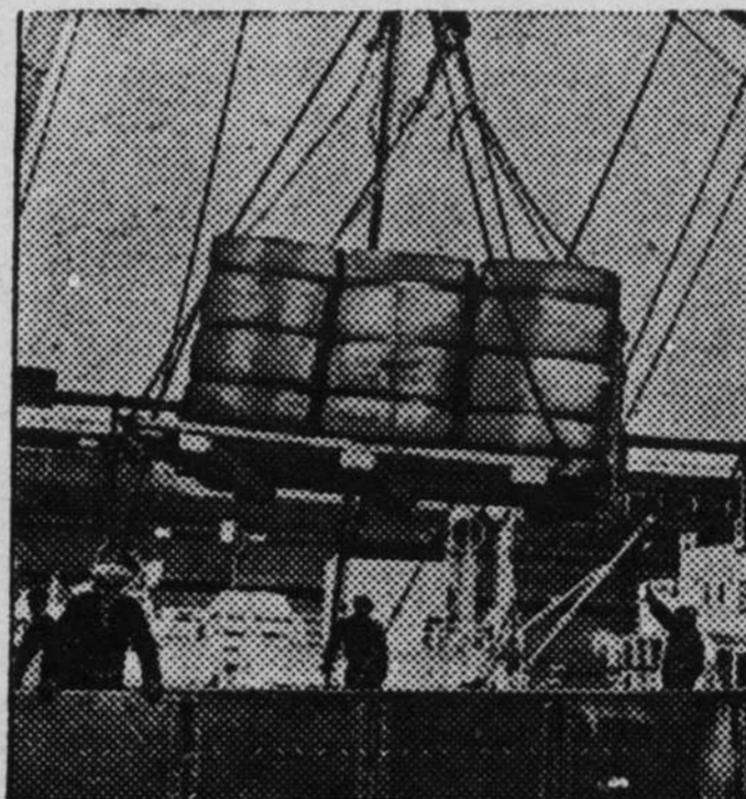
All things go on aboard and about a ship while in port. Down into the hold goes cargo for South America, product of American industry.