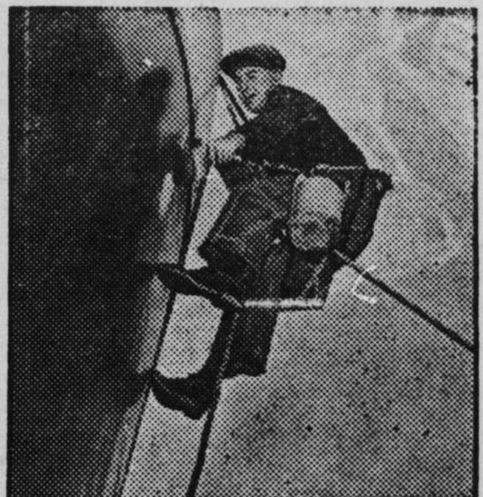
High above, in a bo's'n's chair a member of the shore gang paints the forward funnel of the ship with the Grace Line colors, green base, white band, and black top.