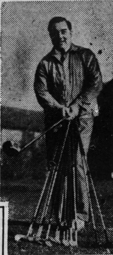
PLAYS FOR CHARITY —John Montague, Hollywood's mystery golfer and strong man who was acquitted recently of an old robbery charge, made his first limelight appearance in a charity golf match with Babe Ruth on a Long Island course. He used golf clubs instead of the shovel with which he once beat Bing Crosby.