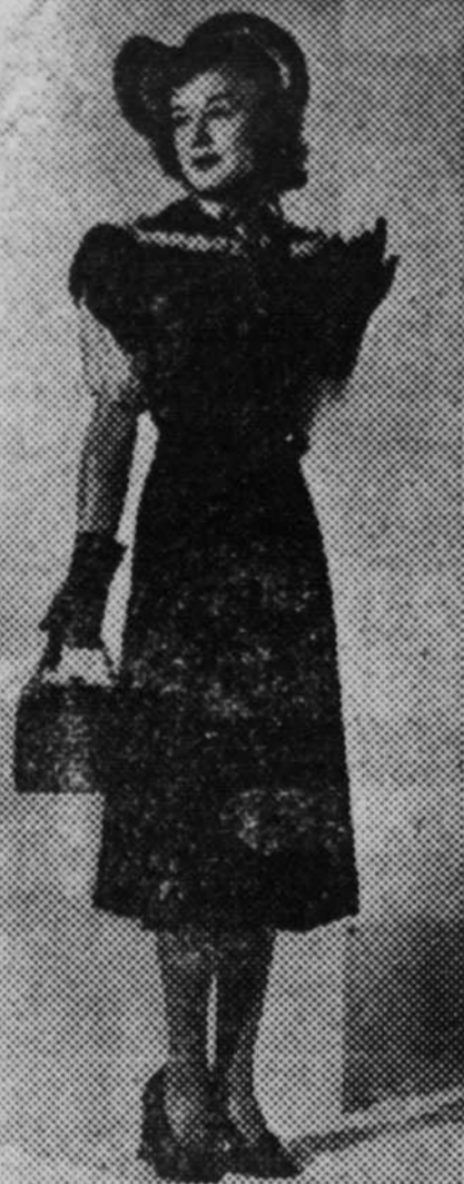
ACTRESS DESIGNED TROUSSEAU — Anne Shirley, 18-year-old radio star, who was recently married to John Howard Payne, designed her trousseau wardrobe herself, including this lovely formal street ensemble made of transparent black velvet and trimmed with cream colored lace.