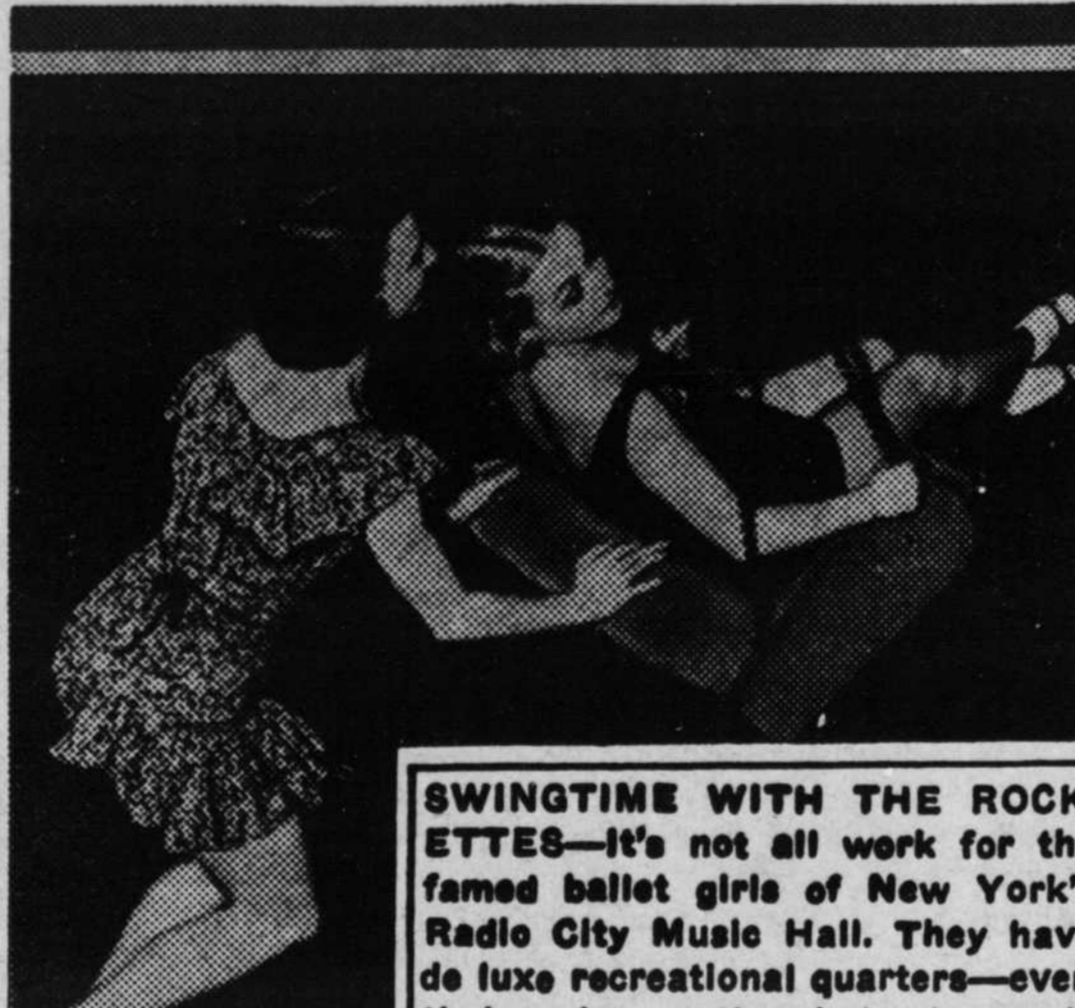
SWINGTIME WITH THE ROCKETTES —It's not all work for the famed ballet girls of New York's Radio City Music Hall. They have de luxe recreational quarters—even their swing, as the photo shows—is upholstered in mohair velvet as softly as an automobile cushion.