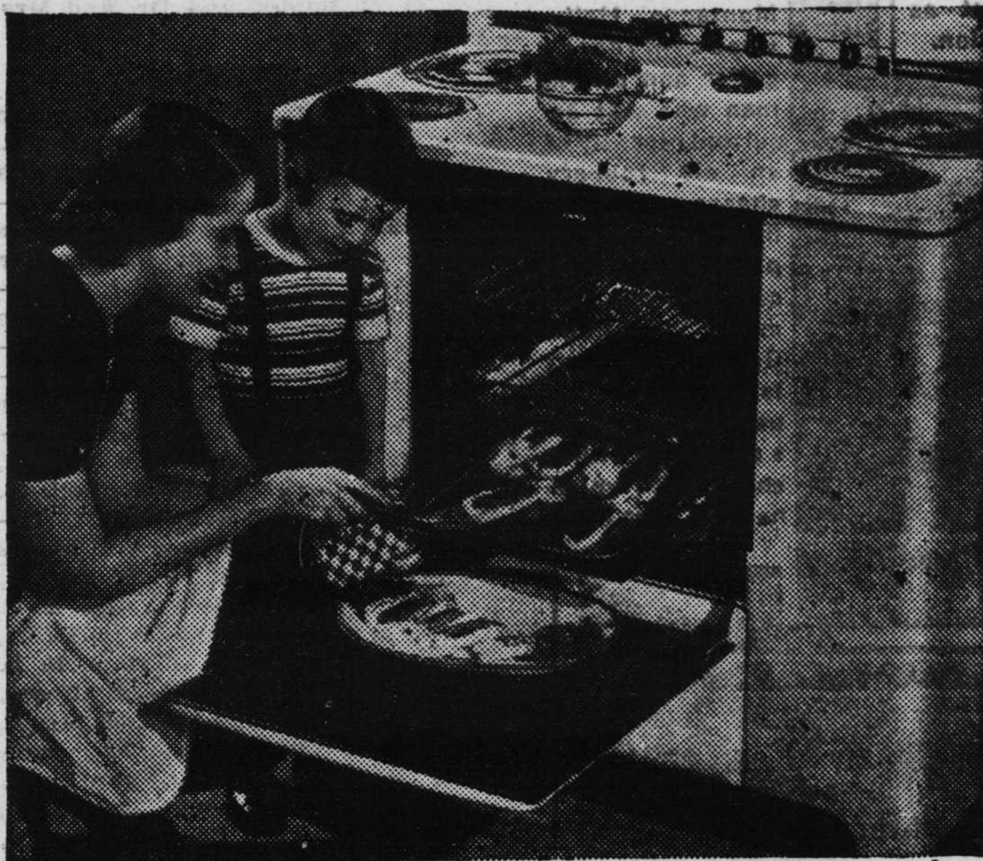
Here's an "afternoon out" meal prepared with the help of the dependable broiler of the electric range.

can allow just fifteen minutes for the final touches her dinner needs when she gets home late in the afternoon.