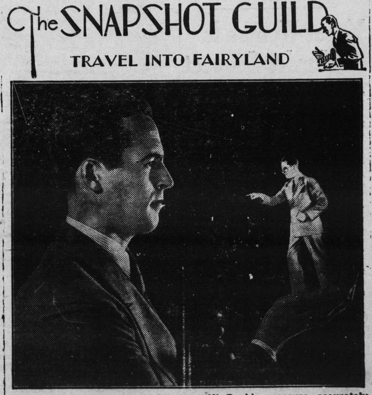
Have a heart-to-heart talk with yourself! Double exposure, accurately planned, will let you.

mately 2.35 miles northwest of the 8-B to approimately 10 miles northeast foot of Connors Pass on Nevada | east with a length of 10.035 mles. E. W. McLeod of the department's Route Number 7, with a length of 29.318 miles, W. W. Clyde and Com- staff will act as resident engineer.