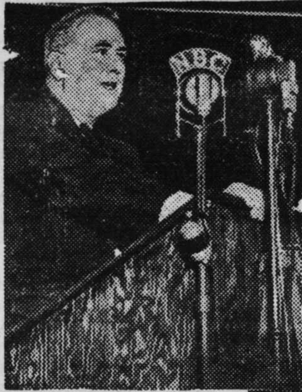
ROOSEVELT LASHES WAR —President Franklin D. Roosevelt, photographed speaking in Chicago at the dedication of the Centennial Bridge over the mouth of the Chicago River. Although making a dedicatory speech, he took occasion to lash war and militaristic powers.

TAILORING FENDERS —The new fender line at De Soto heads the long list of improvements in the press plant that will double the variety of sheet metal. At right workmen are shown removing a new De Soto fender from the huge double-crank toggle drawing press which weighs almost 400,000 pounds.