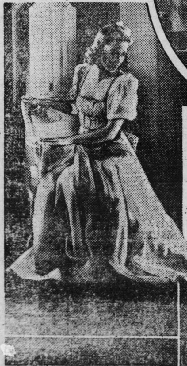
THIS IDEAL DANCE FROCK —designed for Joan Fontaine, screen star, is made of pale blue muselina with a high-waisted bodice and is cut with a low square décolletage plaited in quaint Grecian motif. The skirt is graceful and flowing.