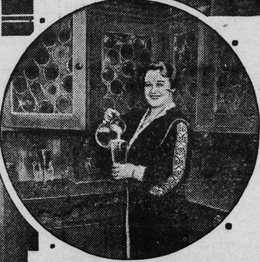
FAMOUS SINGER ENTERTAINS —Madame Elisabeth Rethberg, Metropolitan Opera singer and radio star, has fitted up in her home, a "Hans Sachs Room," named after the famous character in "Die Meistersinger." Here she entertains her fellow artists, serving beer, the beverage of moderation, in this charming Old World Setting.