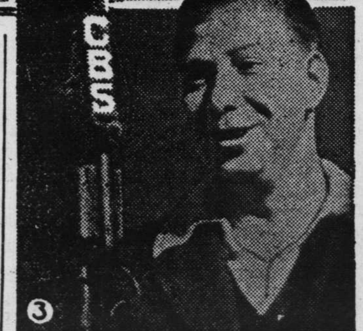
Phil Baker Sunday evenings at 7.30 p.m. E.D.S.T., beginning July 4, for the hot weather cycle.