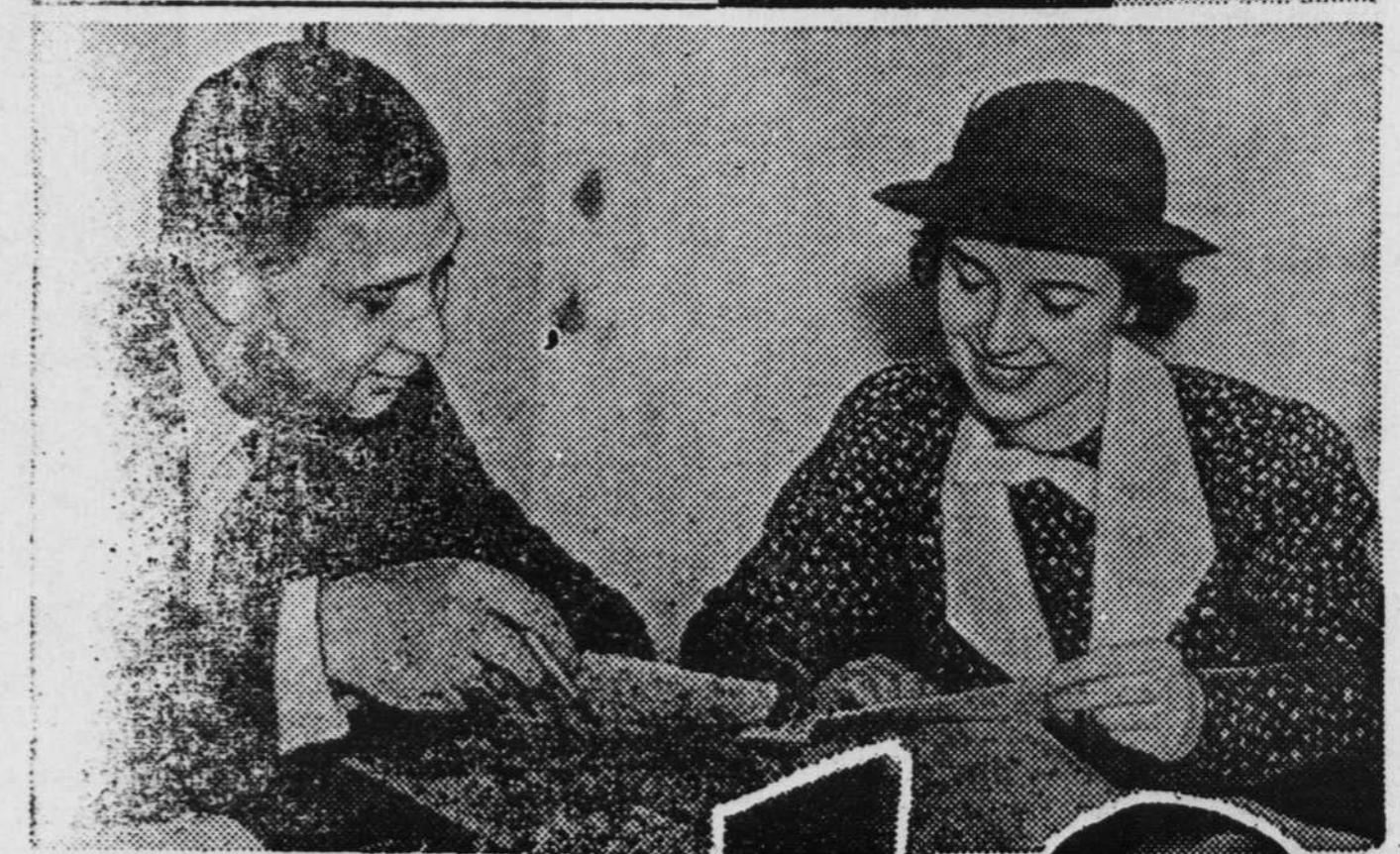
Here's Harry von Zell, radio's most versatile star, (1) writing his broadcast script, (2) interviewing a guest star and (3) On The Air.

Allen discovered his talent for comedy and used him with the Mighty Allen Art Players. Phil Baker gave him even more important assignments and so did Stoopnagle and Budd. With the latter, Harry revealed his skill as a writer of comedy sketches.