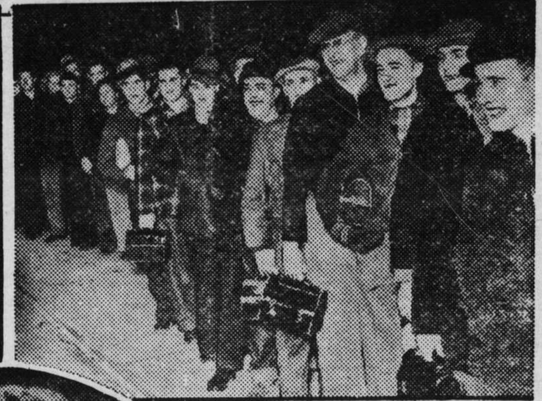
NATION'S WHEELS ROLL AGAIN —Business, slowed down by the auto strike, picks up again as these General Motors employees go back to work and cars start rolling off the line. The workers lost millions in wages during the strike, which ended when the union minority retreated from its demand to represent all employees.