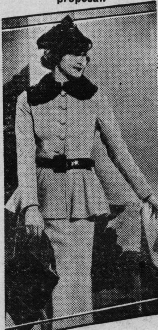
LIGHT SHADES FOR SPRING —Pastel shades are being sponsored for spring suits and here Marian Marsh wears a smart outfit of pale forget-me-not blue wool trimmed with a coachman's collar of black Persian lamb. The jacket has a flared peplum and is belted in black patent leather.