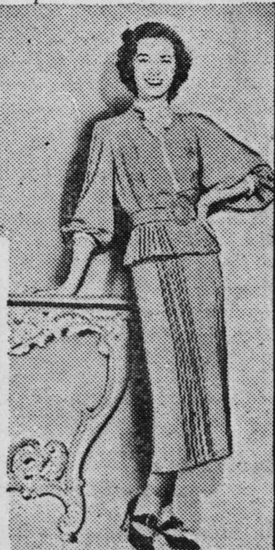
MARSHA HUNT —Paramount Pictures player, featured in a two piece silk crepe dress with pleats giving front fullness, trimmed with white and having a cluster of flowers at the high neckline. The wide sleeves are gracefully gathered below the elbow.