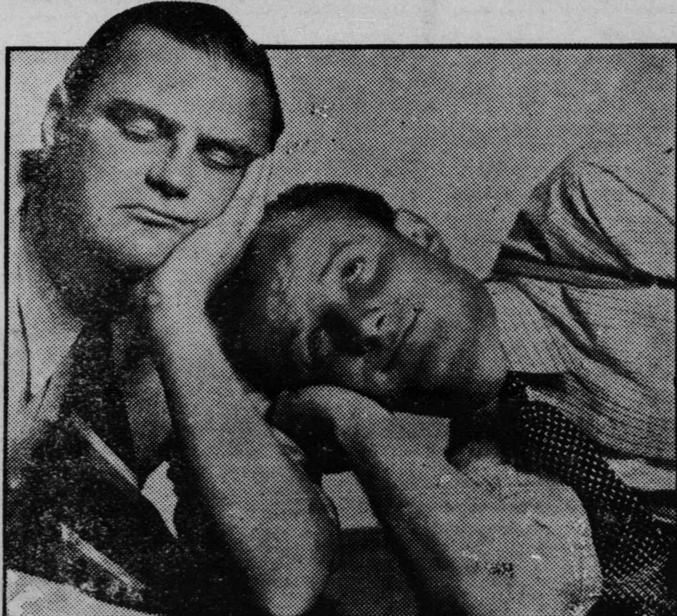
Colonel Stoopnagle and Budd, noted air comedians, were snapped by a staff photographer as they were attempting to muscle in on the hibernating act bears get away with every winter. They spent three days in a cave, trying to dodge work in an attempt to loaf the rest of the winter, and when they were discovered the Colonel, at the left, was sound asleep while Budd, his partner, was trying to think of a reason to wake the Colonel. They came to in time to broadcast Sunday