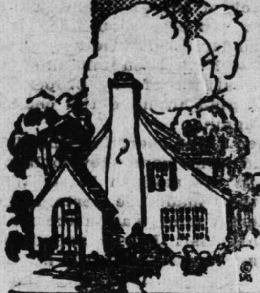
for a HOME