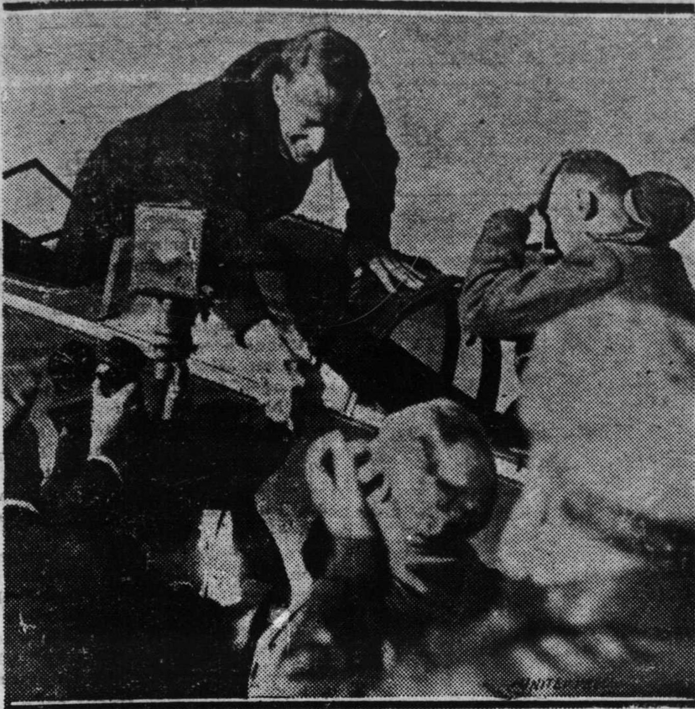
Triumphant in their daring 7695-mile flight from Australia, Sir Charles Kingsford-Smith and his co-pilot and navigator, Capt. P. G. Taylor, are welcomed at Municipal Airport, Los Angeles, after flying from Oakland, where they completed a transpacific flight. Sir Charles greets a friend while Capt. Taylor, right, removes his goggles.