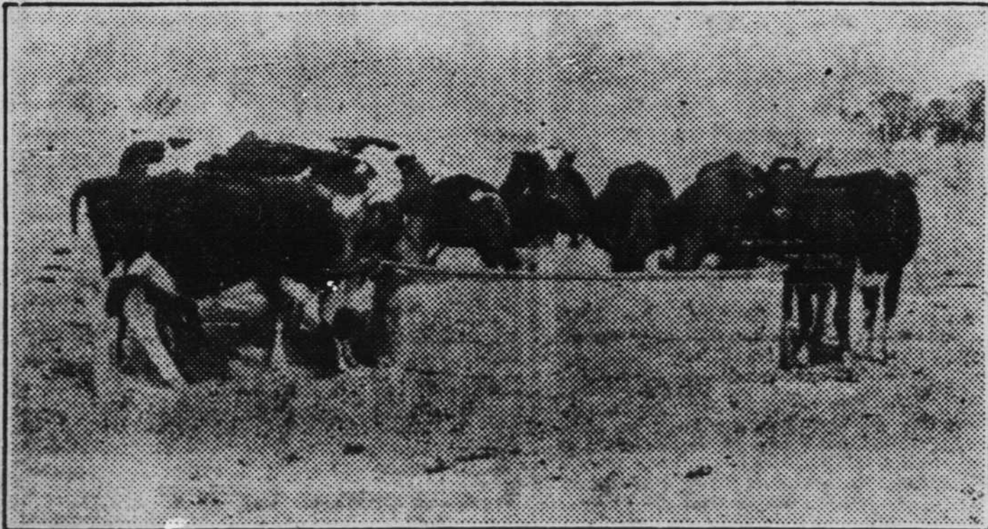
This metal tank watering installation in Churchill County seems quite popular with the Cattle.