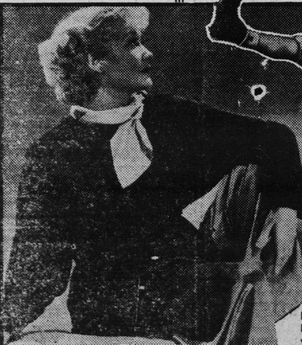
AT EASE — Red satin trousers and sapphire velvet jacket are combined in a stunning pair of lounging pajamas for Miriam Hopkins, movie star. The velvet jacket has dolman sleeves and a rolled kerchief collar which knots on the side.