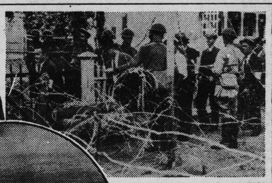
NO MAN'S LAND — National Guardsmen survey strike pickets along the Rhode Island sector of the textile industrial war. At this plant pickets were allowed to patrol the plant under the watchful eyes of militiamen.