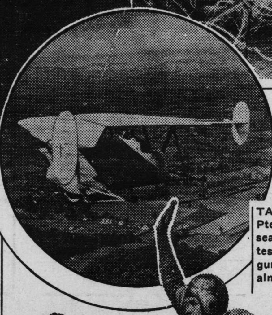
TAIL-LESS AIR FIGHTER — The Pterodactyle Mark V, unique two-seated tail-less fighting plane being tested for the British air forces. The gunner, seated at the back, has an almost unimpeded field of view and of fire.