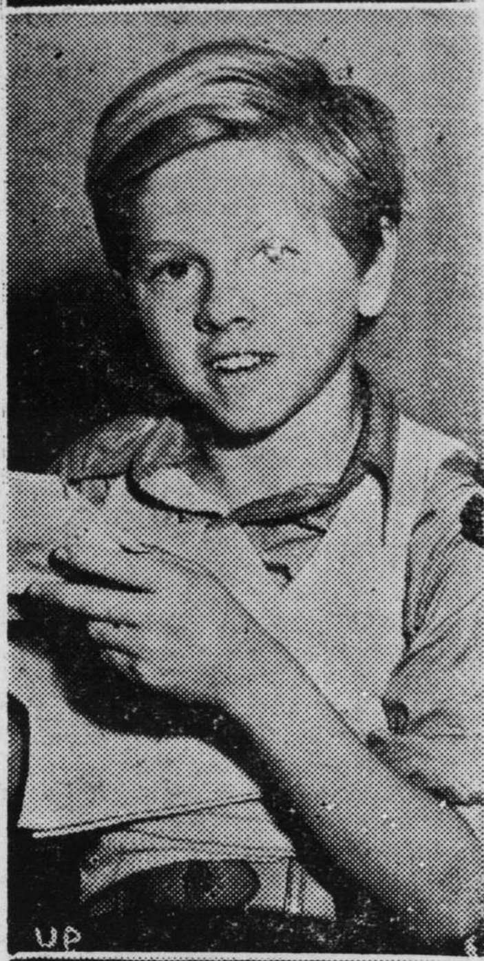
Blame the big grin on Mickey Rooney's face to the fact that he has just signed a movie contract calling for $150 a week.