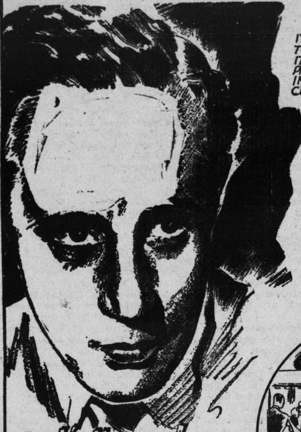
Leslie Howard, ALTHOUGH A LONDONER, WON HIS FIRST SUCCESSES ON THE AMERICAN STAGE AND SCREEN. MANY ENGLISHMEN THINK THE STAR OF "THE LADY IS WILLING" IS AN AMERICAN.

IT TAKES LONGER TO CUT A PICTURE DOWN TO EXHIBITION LENGTH THAN TO PHOTOGRAPH IT. AT THE COLUMBIA STUDIOS RECENTLY A PICTURE THAT WAS "SHOT" IN FIVE WEEKS WAS IN THE CUTTING ROOM FOUR MONTHS!