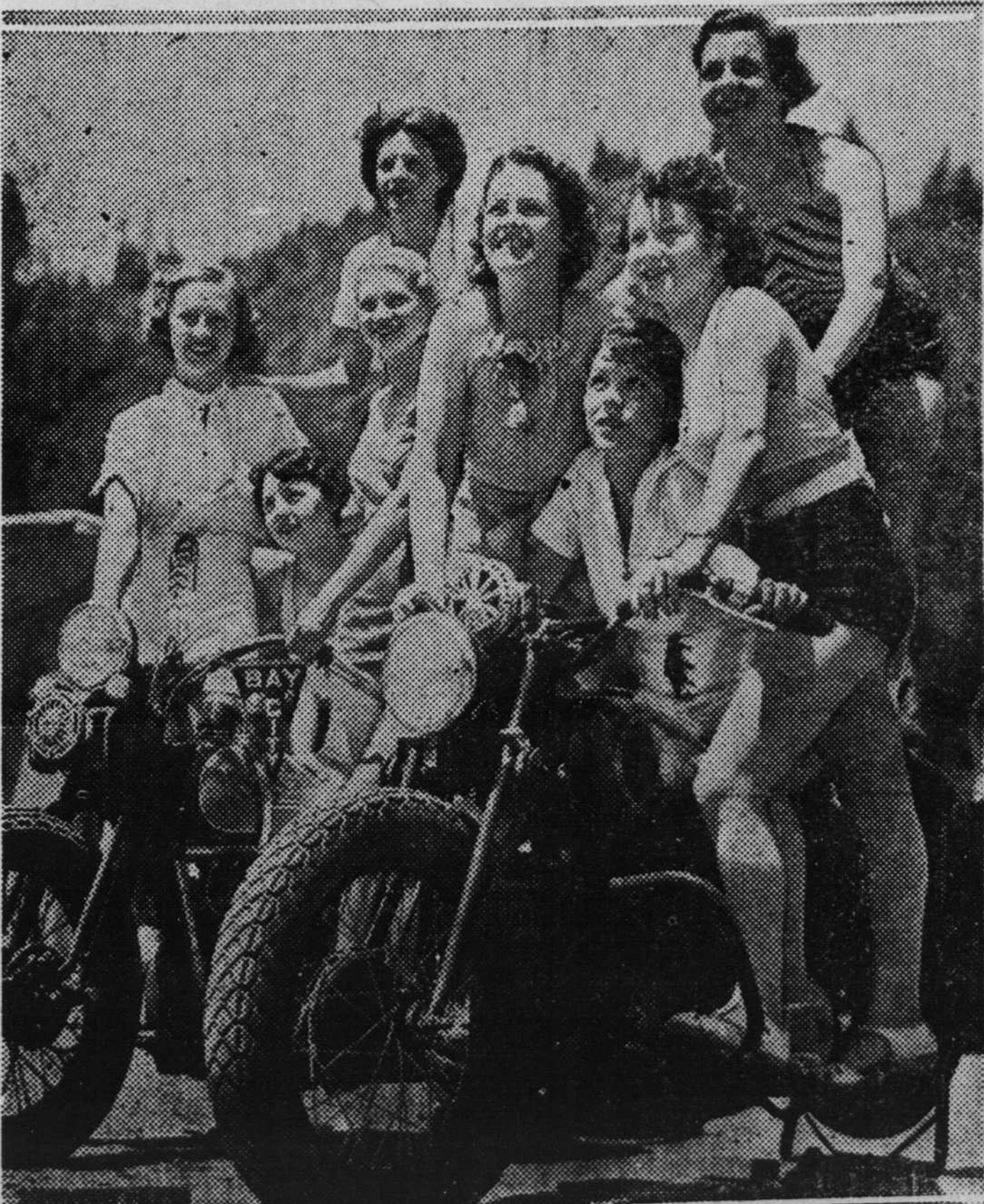
These eight motorcycling beauties are among the candidates entered in the race for "Queen of the Redwood Frolic Celebration" to be held in Guerneville, Cal., Aug. 17-18-19.

URGED COLLECTIVE SYSTEM ISLE OF SHOALS, N. H. —(UP)— Dr. John Haynes Holmes, New York clergyman, urged those attending a Unitarian Youth Conference here to give all their surplus earnings, including income from investments, to the work of getting rid of capitalism and establishing "a cooperative or collective system of society." The prize jackass is the fellow who believes that the government can run itself into debt without somebody having to pay the bill.