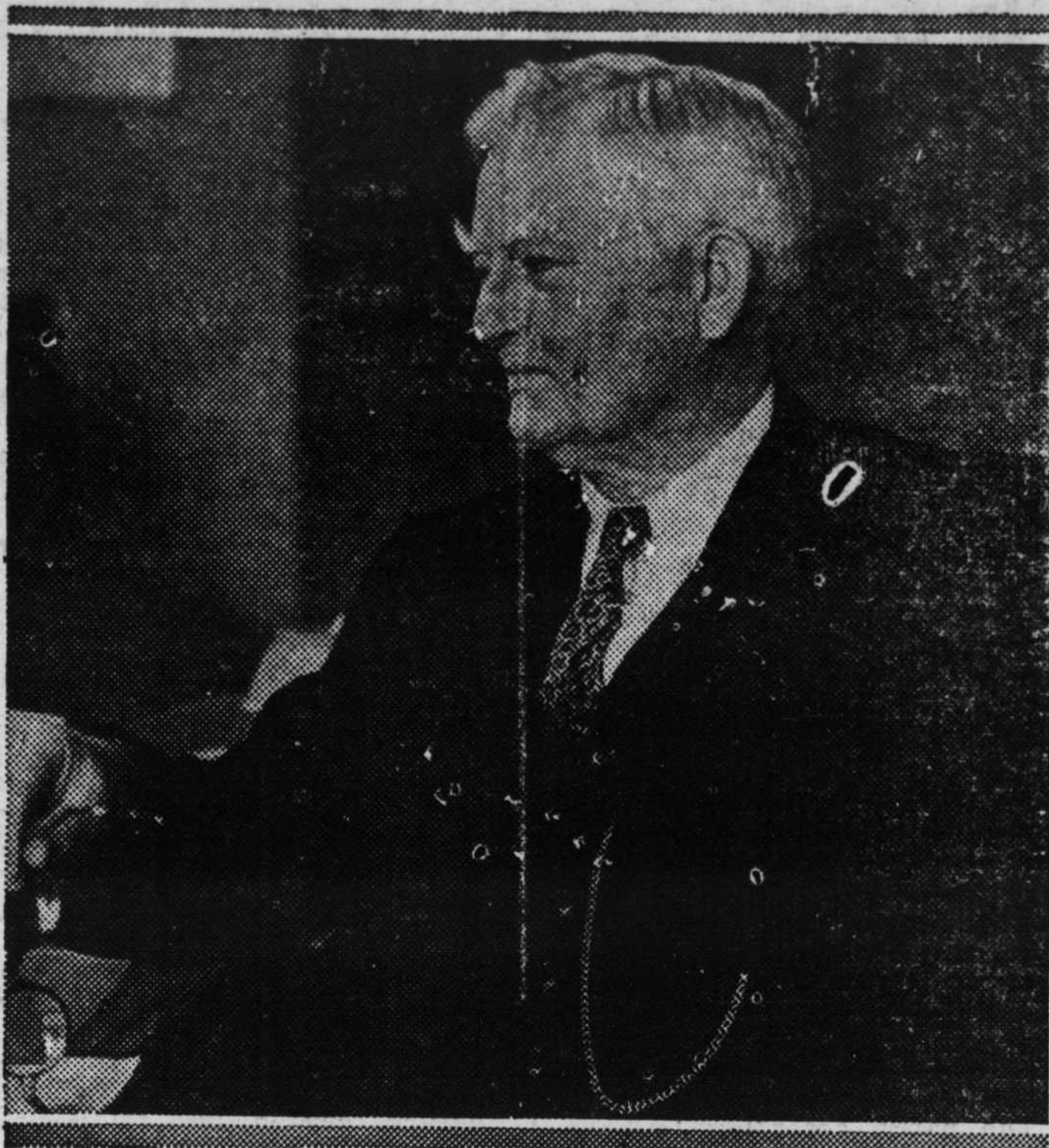
Vice President John Nance Garner

NO MATTER what toastmasters and caption writers may say, Vice President Garner insists that his job is not the second most important post in the United States government. "Delightful it is," he says in the American Magazine, "but almost entirely unimportant." He calls himself, in fact, "merely the spare tire on the national automobile." The photograph shown above