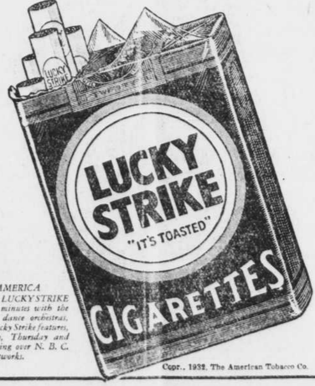
© K. AMERICA TUNE IN ON LUCKY STRIKE - 60 modern minuts with the world's finest taste, and famous Lucky Strike features, every Tuesday, Thursday and Saturday evening over N. B. C. network. Capt., 1932, The American Tobacco Co.

DO you inhale? Lucky Strike meets the vital issue fairly and squarely ... for it has solved the vital problem. Its famous purifying process removes certain impurities that are concealed in even the choicest, mildest tobacco leaves. Luckies created that process. Only Luckies have it! Do you inhale? Of course you inhale! Every smoker breathes in some part of the smoke he or she draws out of a cigarette. And since you do inhale—make sure—make absolutely sure—your cigarette smoke is pure—is clean—that certain impurities have been removed! "It's toasted" Your Protection—against irritation—against cough