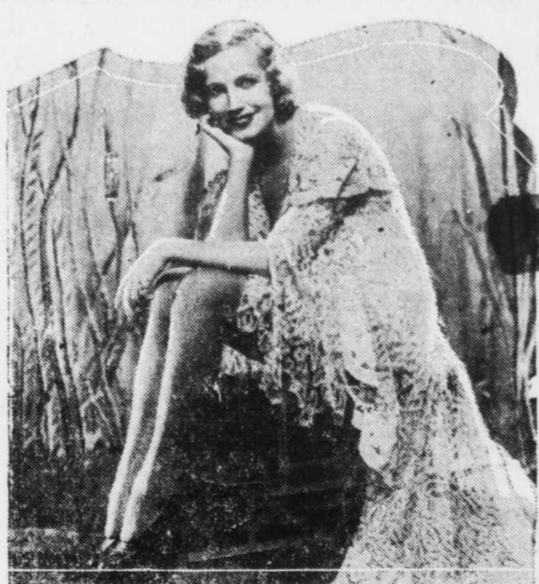
CLAUDIA DELL PALACE—Tuesday and Wednesday